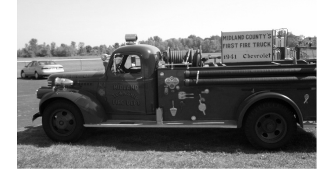
Midland County's first fire truck was parked for everyone to see. It was a red 1941 Chevrolet.