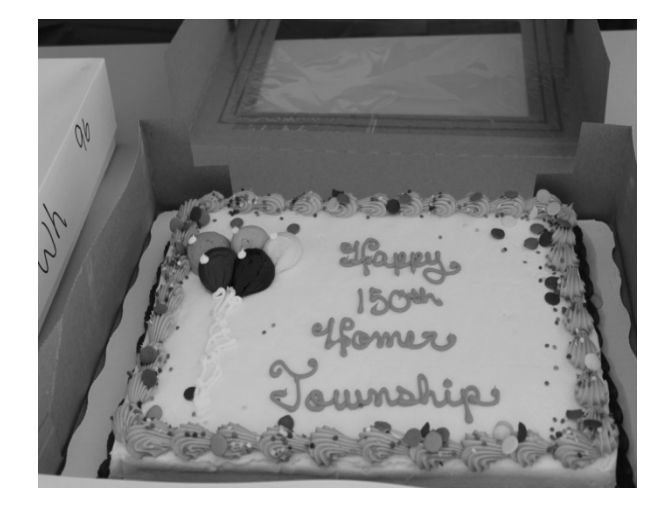
There was a cake for all to enjoy as we celebrated the 150<sup>th</sup> year of Homer Township.