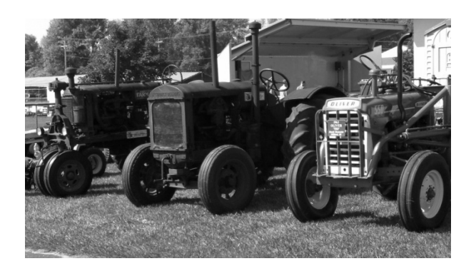
Homer Township Newsletter

There were old tractors to see and we wondered how the farmers used them "back in the day".